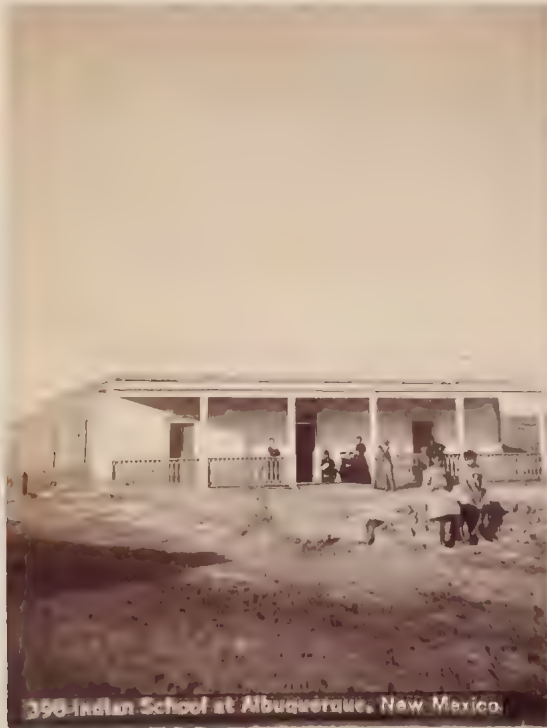
396-Indian School at Albuquerque, New Mexico.